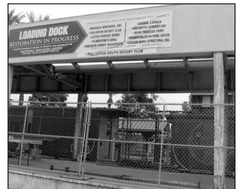
This banner credits the many donors who are partnering in the loading dock restoration project, assisted by Fullerton Heritage.

Donations are still needed to complete the framing, repair the roof drainage system, and to install new roof material. Call the Fullerton Heritage hot line at 714-740-