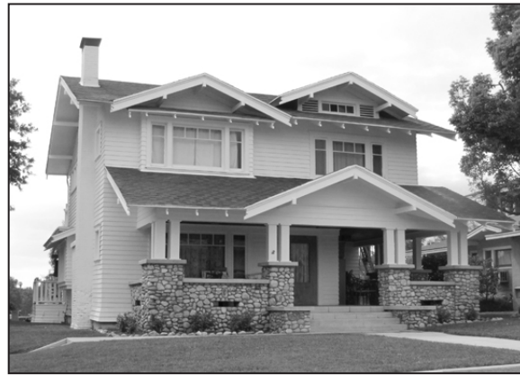
This handsome 1913 Classic Craftsman house, a Fullerton Local Landmark, is just one of the six historic homes that will be on Fullerton Heritage's Home Tour to be held Saturday, June 27.

At the request of a majority of the residents in an area and with City Council approval, an area can be designated a Preservation Zone.